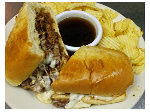
French Dip 6 oz. Philly beef steak with Swiss cheese and au jus 7.89

Three soft shell seasoned beef tacos, lettuce, cheese, tomato and taco sauce 6.69